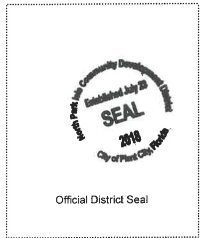
Official District Seal